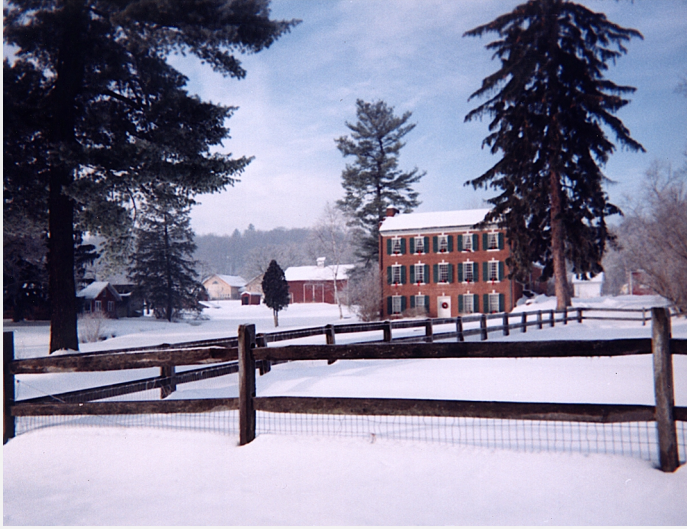
The Jonathan Hale Homestead, built between 1826 and 1832, is at Hale Farm and Village, not far from the Cleveland-Massillon Road Corridor. This house and the surrounding re-created village provide a good lesson in 19th century life and architecture in the Western Reserve.

Lastly, the township has recently approved an amended Bath Township Zoning Resolution which emphasizes the open space and rural character that citizens have supported so strongly in the Comprehensive Plan.