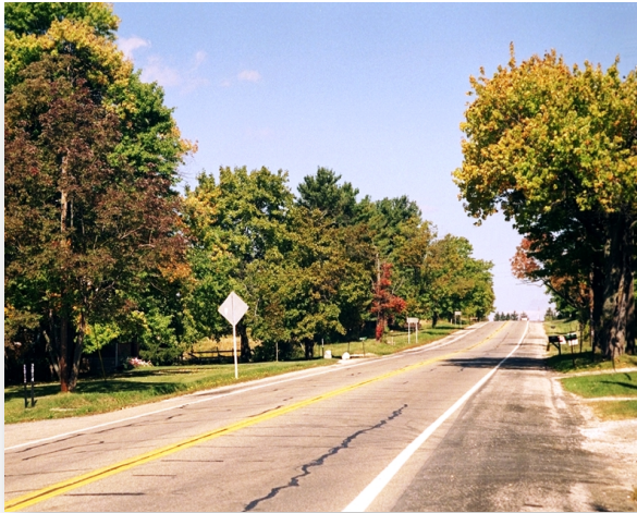
Bath Township residents have expressed a strong desire to preserve the rural streetscape along the Cleveland-Massillon Road Corridor.

In 1997, after several years of discussion and public hearings, the Bath Township Trustees accepted a Comprehensive Plan for the continuing development of the township. The plan recognized the desire of the citizens of Bath to preserve what was identified as the "rural character" of the township.